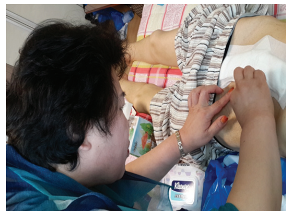
Home Visiting Care