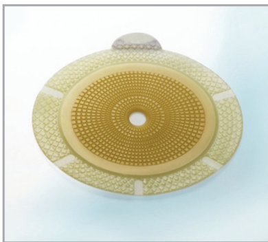
Double layer adhesive