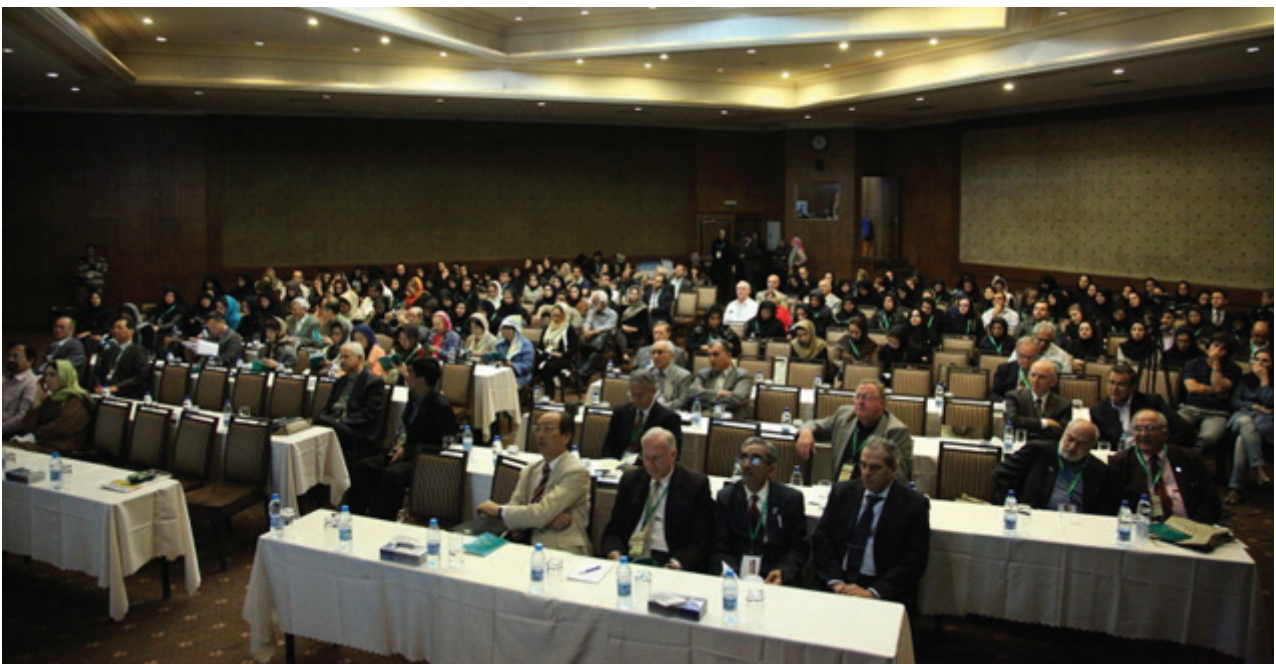
Lobby Activities & World Meetings