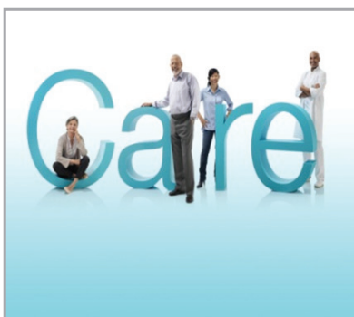
Successful transition to home