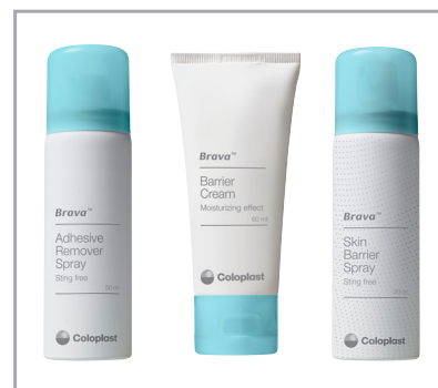
Extra skin care and protection