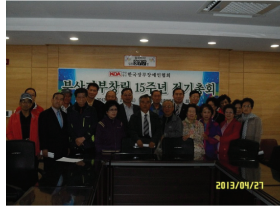
Monthly Meetings of the Branches