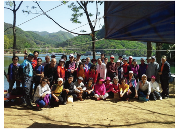
Picnic and Mountain Climbing