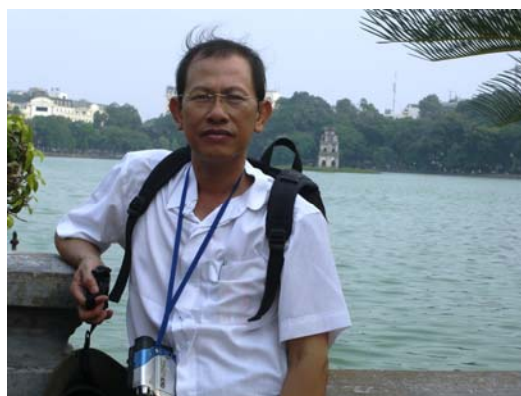
In Ha noi, Viet Nam – 2009