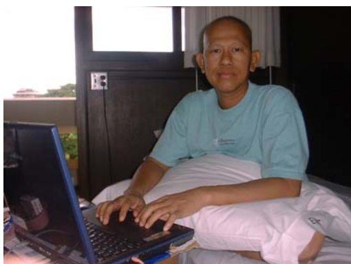
Under chemotherapy, in Hawaii, USA – 2003

Nowadays, he is the president of Anti-HIV and Anti- Cancer Association in his home town, Bac Lieu province, Viet Nam. Few words are written for our ostomates in the world, having the optimistic mind you could come over everything and be enjoy with your life. His full story will be send to our friends in the next AOA newsletter.